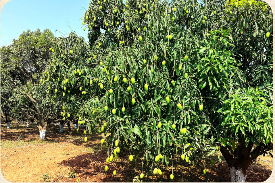
Mango Orchid at Deer Valley Estate