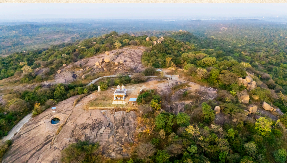
Temple at Deer Valley Estate