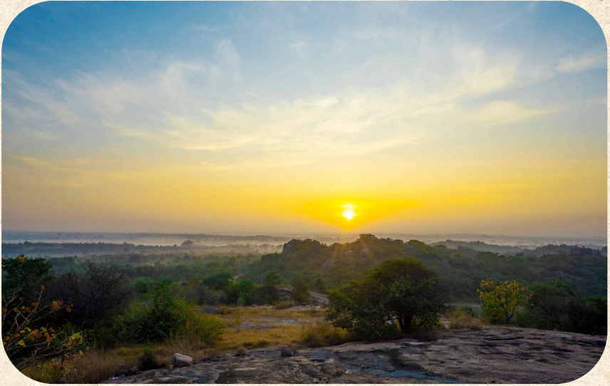
Pristine Environs at Deer Valley Estate