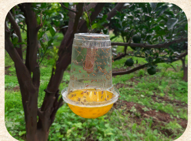
Traps for fruit flies

Pheromone traps (for fruit flies) are used for monitoring and mass trapping insects.